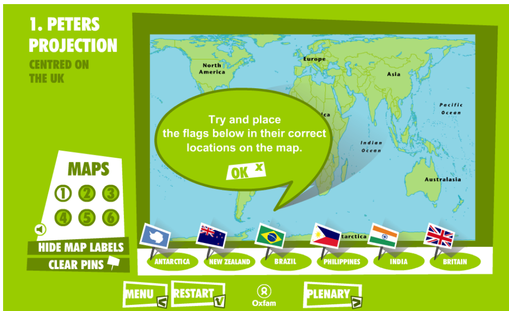
Screen shot from "Mapping our World."